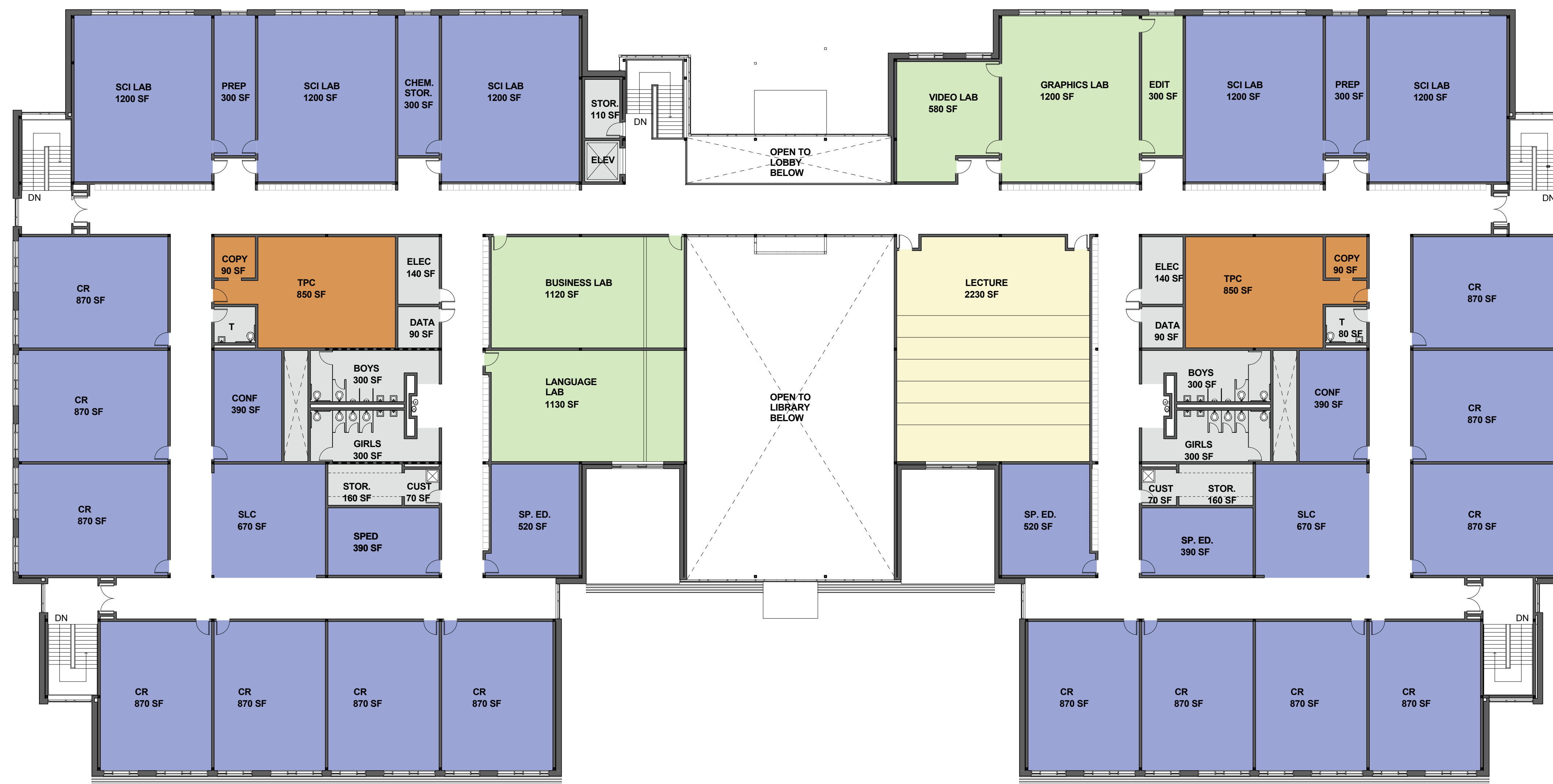
1 Building B - Illustrated Second Floor Plan Scale: 1/16" = 1'-0"